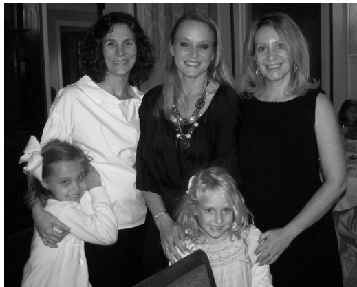
Left: Mothers and daughters after the 2010 EHS GH tea.