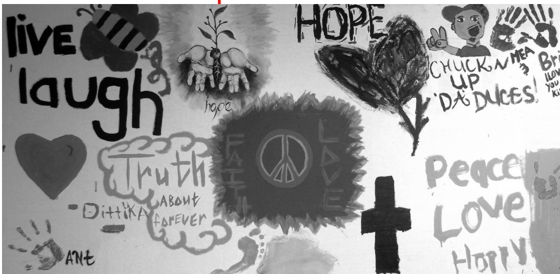
Mural , above, created by residents while working with a Converse Art Therapy student.

25 to life that's crazy Waking up wanting to die that's crazy Every second wanting to cry that's crazy Never having a chance to say good bye that's crazy Every second asking why that's crazy Staying up 'cause you afraid to say good bye that's crazy Lie to your mom 'cause you afraid to be beat that's crazy A book is your only escape for peace that's crazy It might be crazy for you but for me that's life