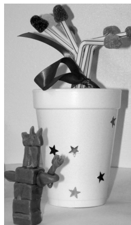
Pictured left, a group artistic depiction of the 4th of July (Statue of Liberty and Fire Works) during summer programming.

loving it. When asked after the week, “How was camp?”, she jumped into the air with excitement. She said, “ It was awesome! ” The rafting is what she brought up first. She said, “ I went rafting, and it was so much fun, and I even jumped off a cliff into the water! ”