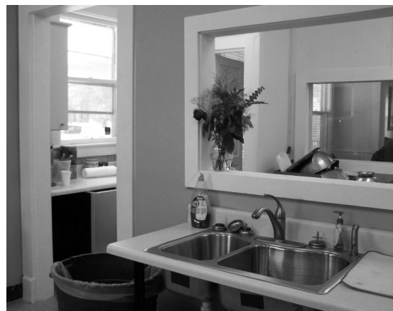
Above: The kitchen to our largest cottage was renovated thanks to volunteers & in-kind donations from Dal Tile, First Baptist Church of Spartanburg, Spartan Tile & Wade's.